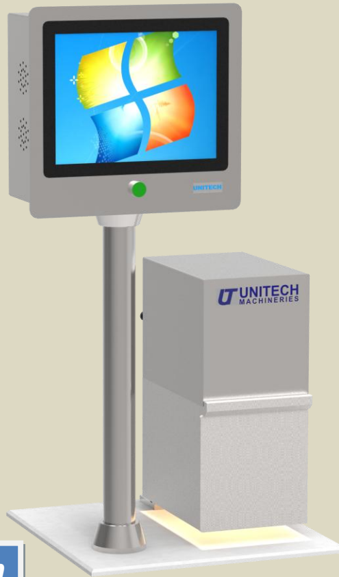
Blister inspection system